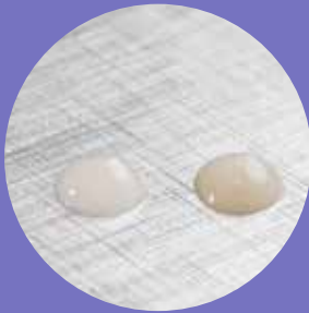
Clear formula (D-Lish Varnish pictured on left.)

Smooth, translucent no-mix formula | Sensitivity relief for all ages | Gluten-free