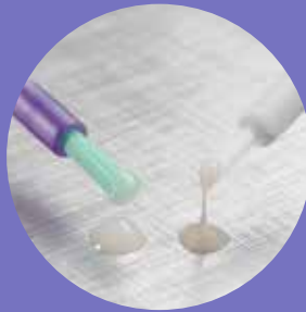
No stringing or clumping (D-Lish Varnish pictured on left.)